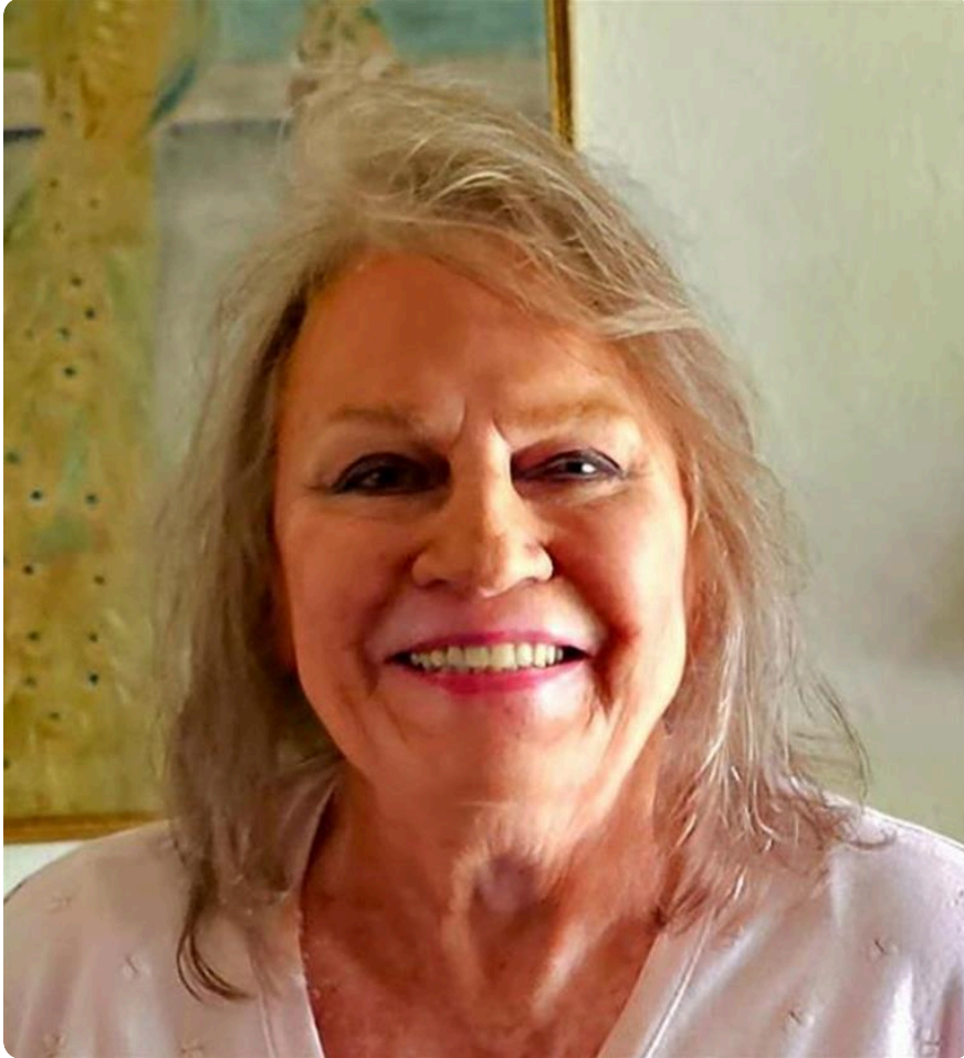
One of our latest pictures 2024